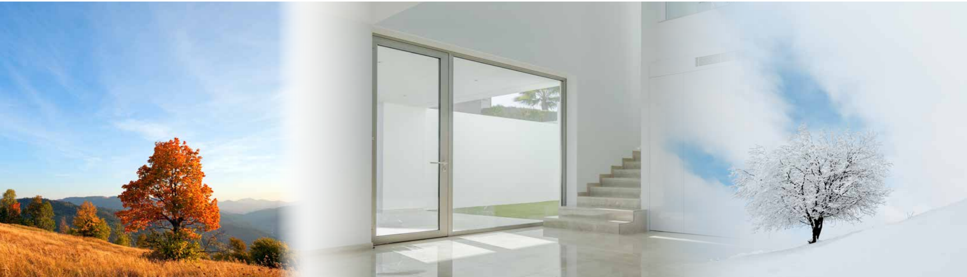
MASTERLINE 8 STANDARD

The newly achieved certificates add further credibility to Reynaers' sound reputation as a developer of sustainable aluminium systems for energy efficient building. These achievements should not be seen in insulation, but rather as a continuation along the route towards increasingly sustainable aluminium solutions for the European building industry.